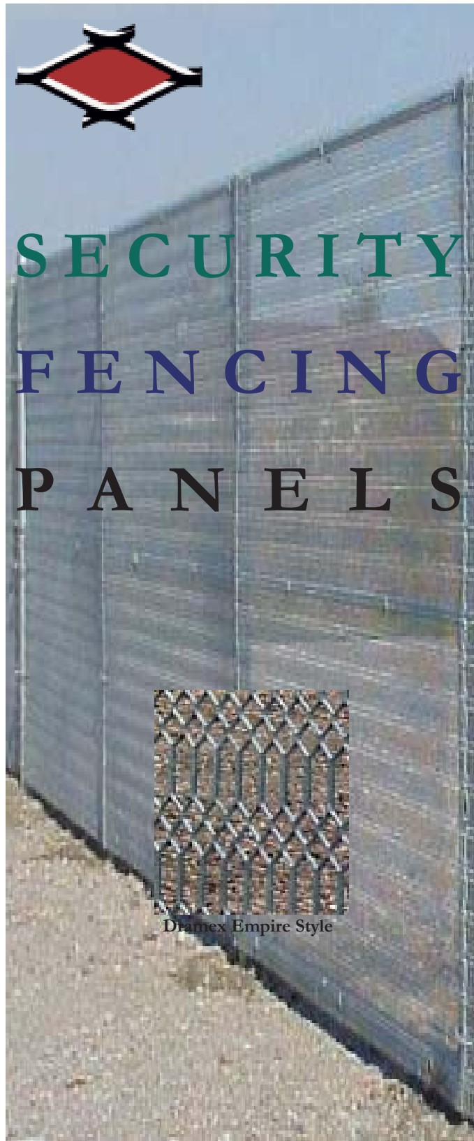
Dramex Empire Style