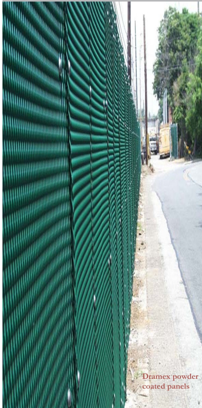
Dramex powder coated panels